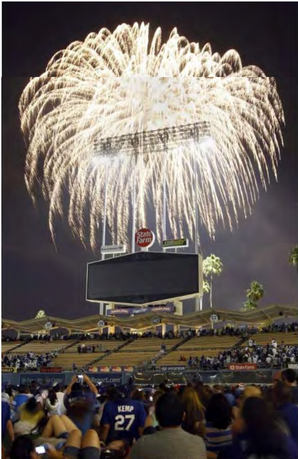
Fireworks explode for Fourth of July celebrations after the New York Mets played against the Los Angeles Dodgers in their MLB National League baseball game in Los Angeles. The Mets won the game.