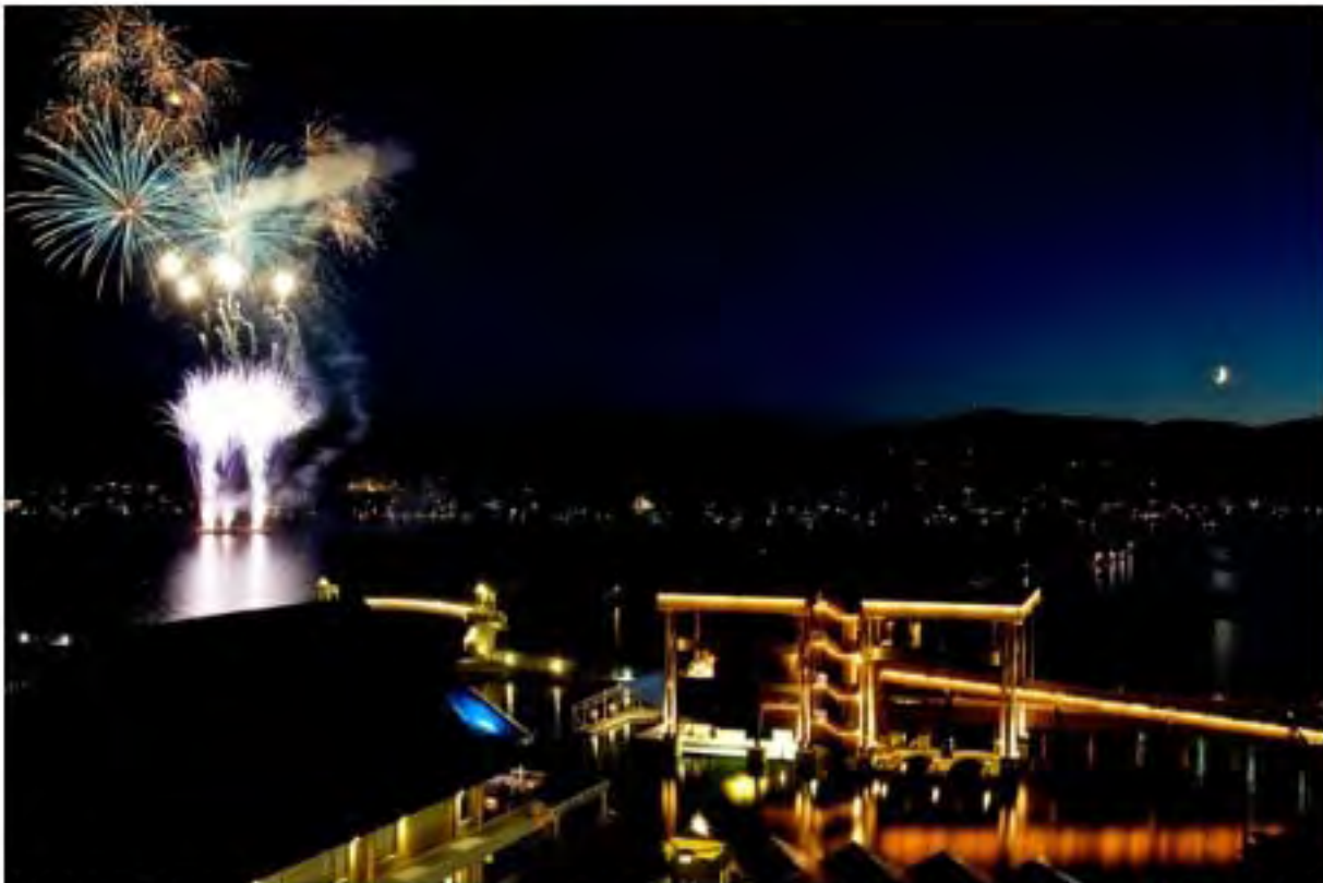
Fireworks light up the night sky during the Fourth of July show over Lake Coeur d'Alene in Idaho.