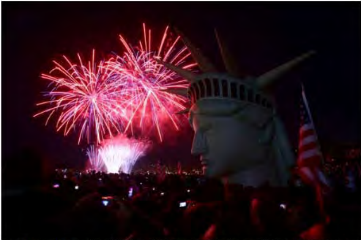
Fireworks explode behind a life-size, inflatable head of the Statue of Liberty at Gas Works Park in Seattle during the Family 4th on Lake Union celebration.