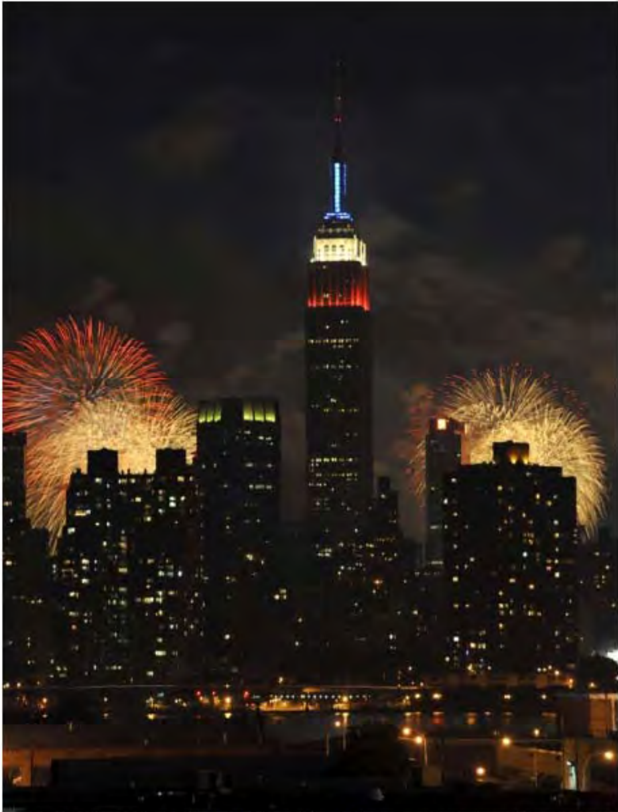
The Empire State Building, with red, white and blue lights, is seen from across the East River in Queens, as fireworks explode over the Hudson River during the Macy's Fourth of July fireworks show.