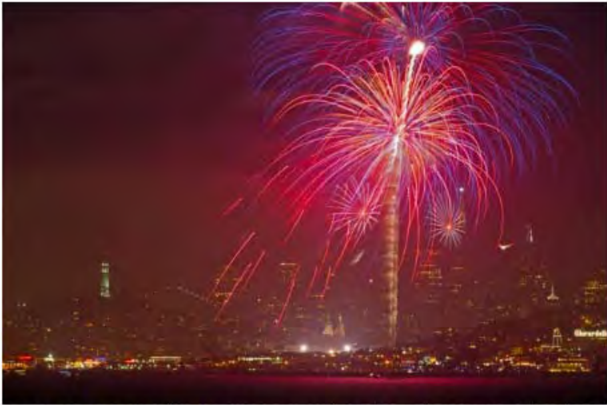
The July 4th celebratory fireworks are seen exploding in air over San Francisco Bay with San Francisco in the background.