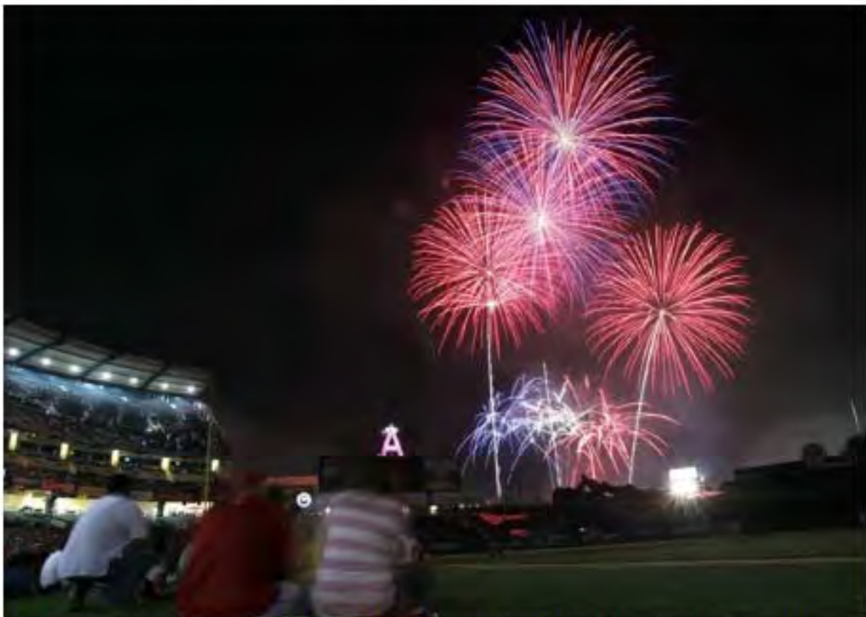
Los Angeles Angels' players and their families watch fireworks after their baseball game against the Detroit Tigers in Anaheim Calif. The Angels won 5-1.