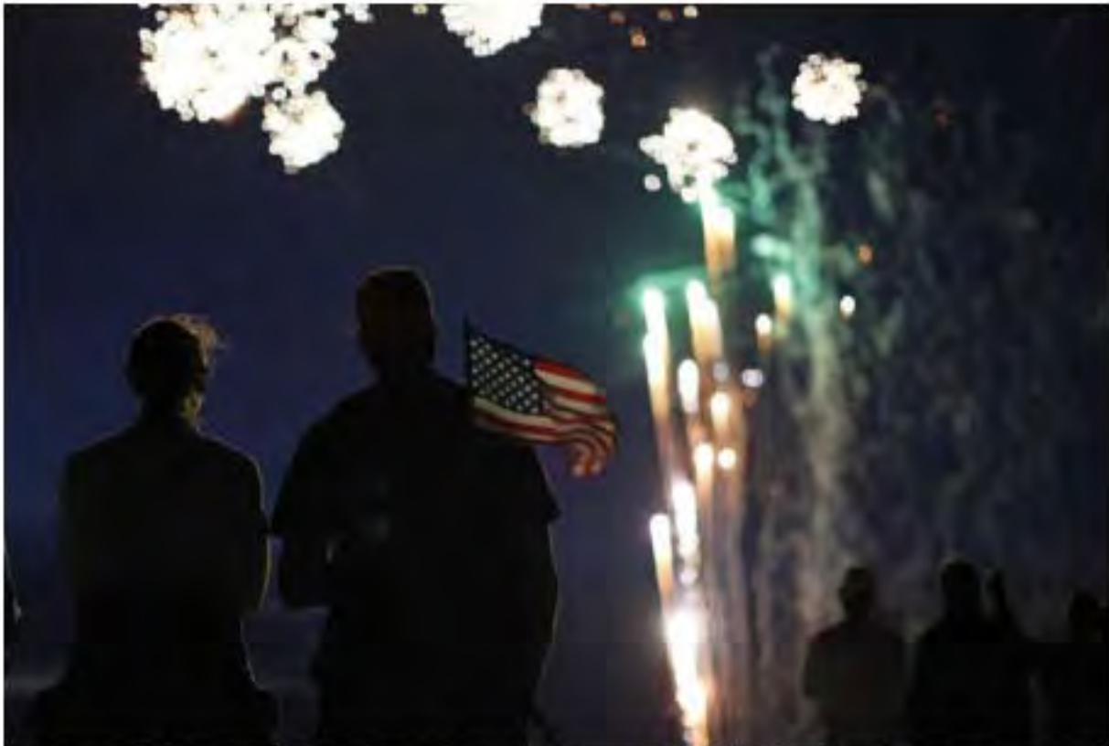
People watch Fourth of July fireworks on a sandbar in Barnstable Harbor, Mass., on Independence Day.