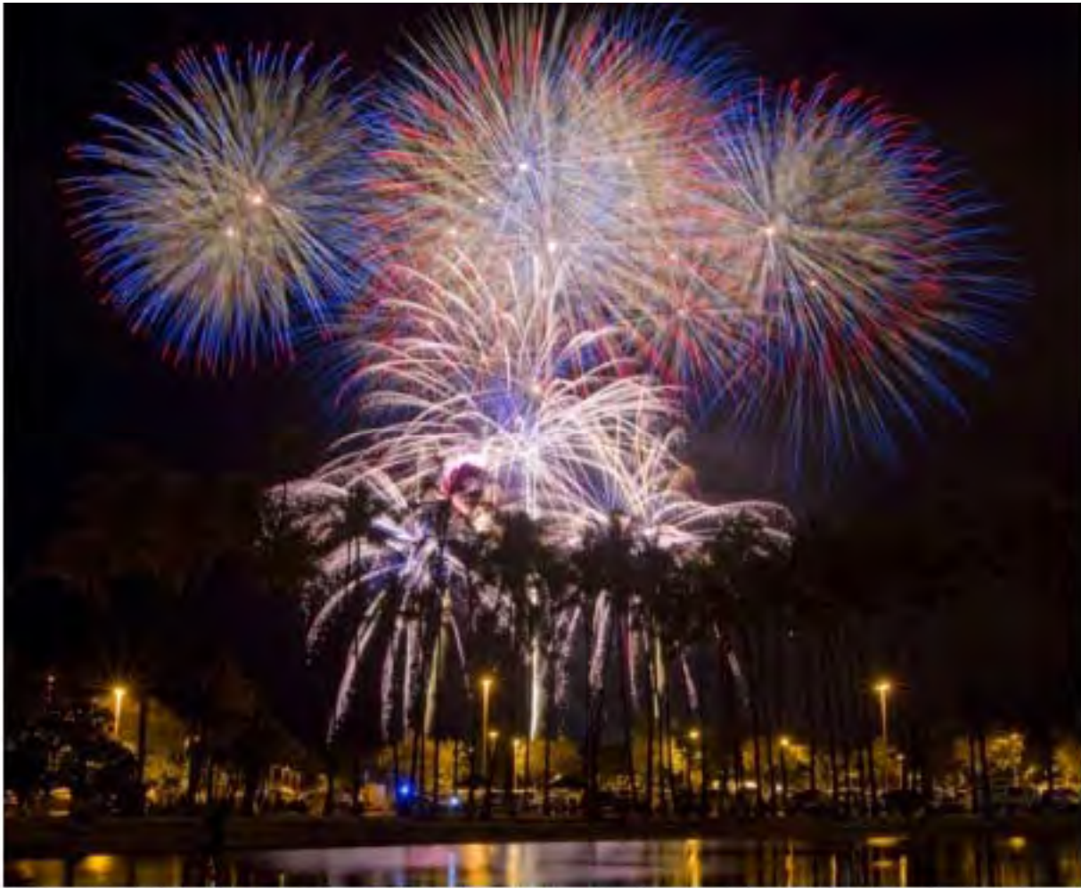
Fireworks fill the sky over Honolulu for the Independence Day celebration. Thousands of Oahu residents and visitors gathered at Magic Island and Ala Moana Beach Park to see the annual Fourth of July fireworks show.