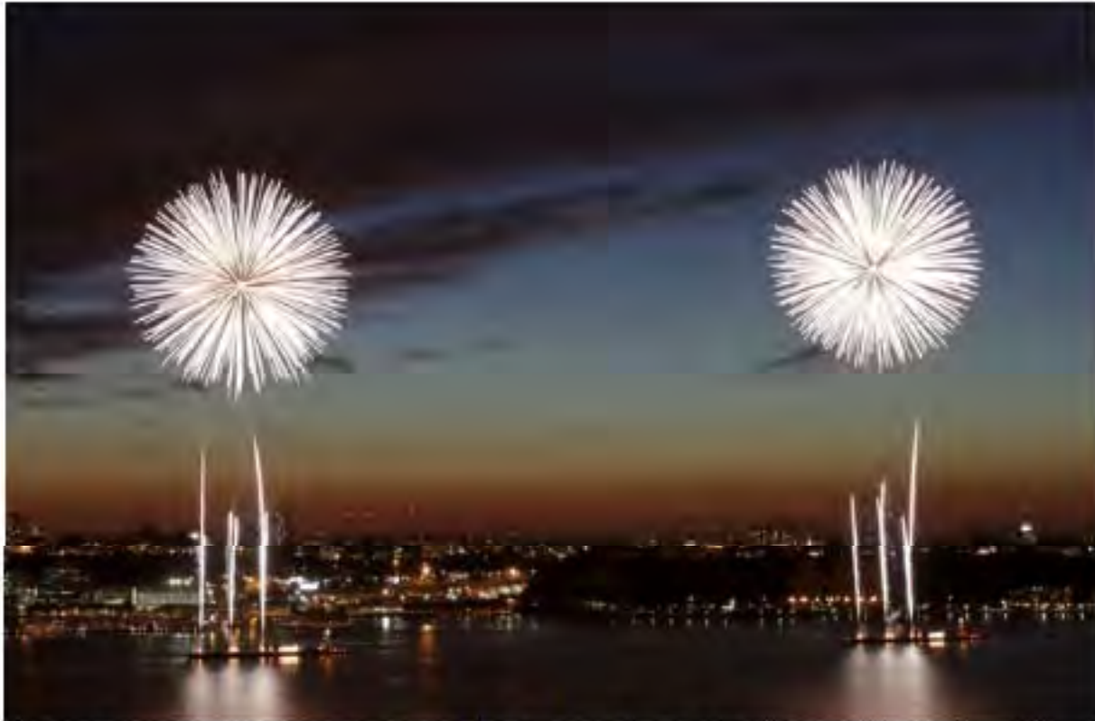
Fireworks are launched from barges on the Hudson River in New York.

On the nation's 235th birthday, fireworks were set off once again, in baseball fields, from barges floating in the water, over monuments, and in countries where our soldiers were stationed abroad. See photos of the combustible brilliance below: