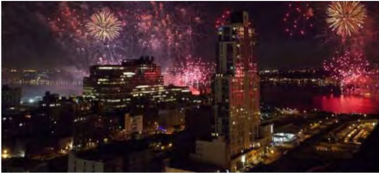
Independence Day fireworks illuminate the sky over the Hudson River and a portion of Manhattan's West Side Monday.