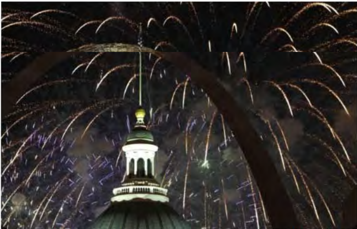
Fireworks light up the night sky behind the Gateway Arch and the Old Courthouse in St. Louis.