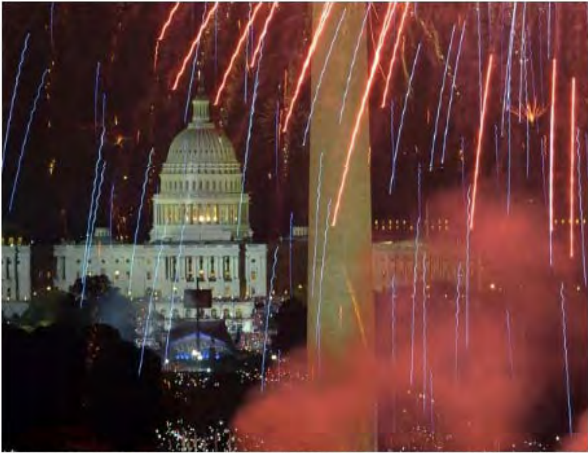
A view of Fourth of July fireworks on the Mall.