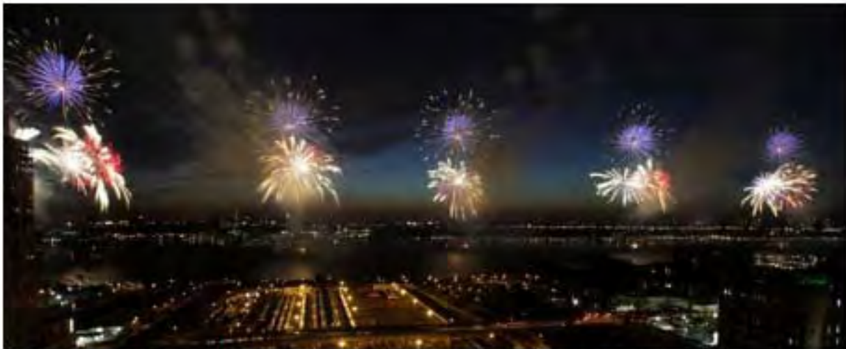
Fireworks explode over the Hudson River in New York.