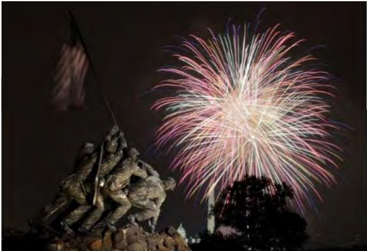
The United States Marine Corps War Memorial, better known as the Iwo Jima Memorial, is seen in Arlington, as fireworks burst over Washington, during the annual Fourth of July display. The Washington Monument and the Capitol can be seen in the distance.