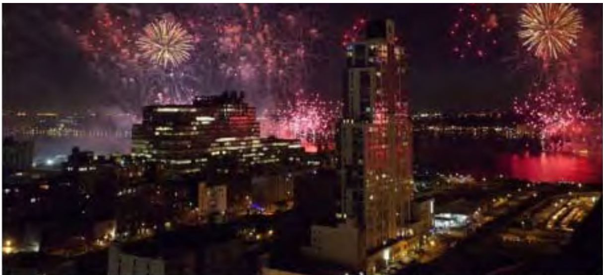
Independence Day fireworks illuminate the sky over the Hudson River and a portion of Manhattan's West Side Monday.